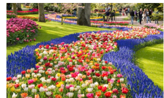
Tulip Time Rhine Cruise 4/20