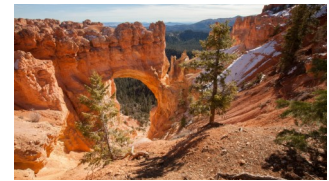
SW Canyon Country 9/19