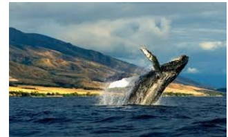
Maui Getaway 2/20