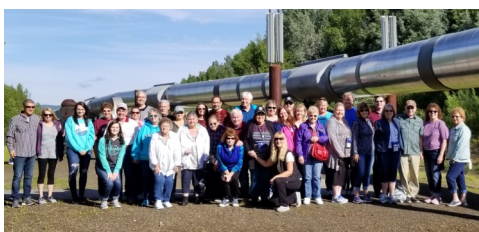
Trans Alaska Pipeline, near Fairbanks