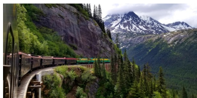
White Pass and Yukon Railroad, Skagway