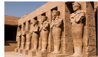
Treasures of Egypt 11/20