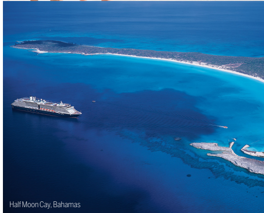
Half Moon Cay, Bahamas

ITINERARY: Fort Lauderdale, FL, US; Half Moon Cay, Bahamas; Oranjestad, Aruba; Willemstad, Curacao; Cartagena, Colombia; Enter Panama Canal Cristobal, Gatun Lake, Exit Panama Canal Cristobal, Colon, Panama; Puerto Limon (San Jose), Costa Rica; Fort Lauderdale, FL, US