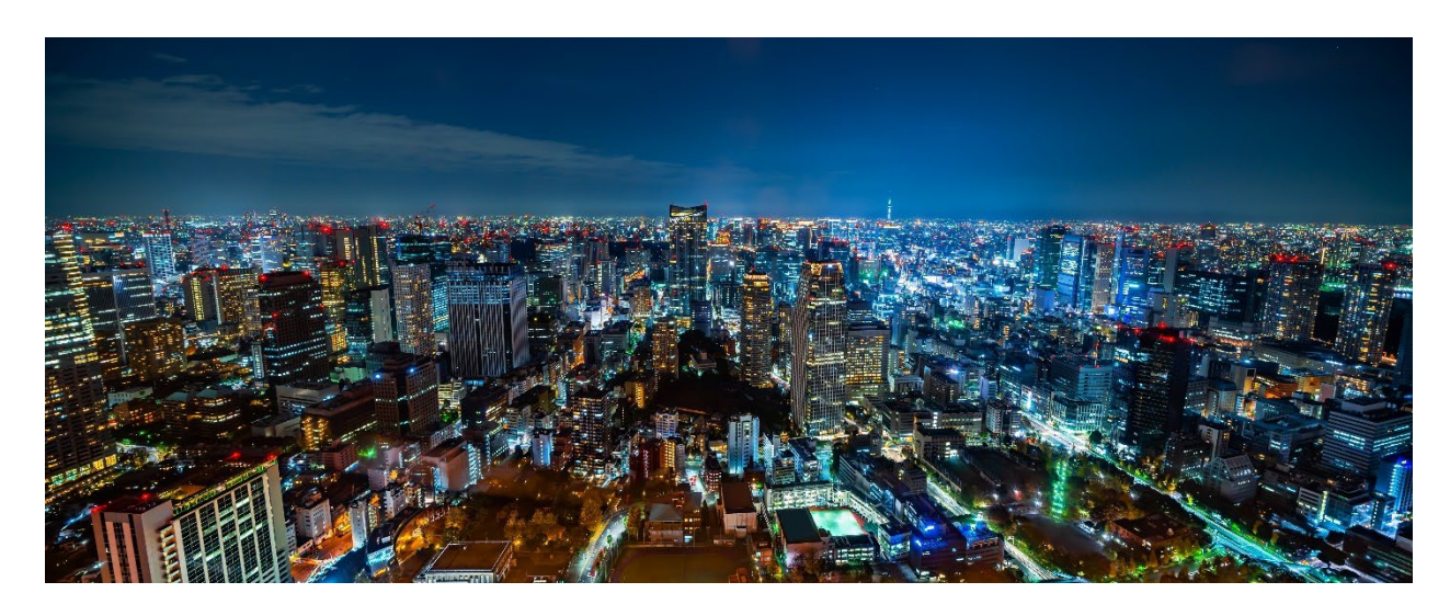
Aerial view of Tokyo skyline at night

1. Tokyo, Japan: From bustling cityscapes to tranquil temples, Tokyo offers a mix of modern and traditional charm that's perfect for Instagram.