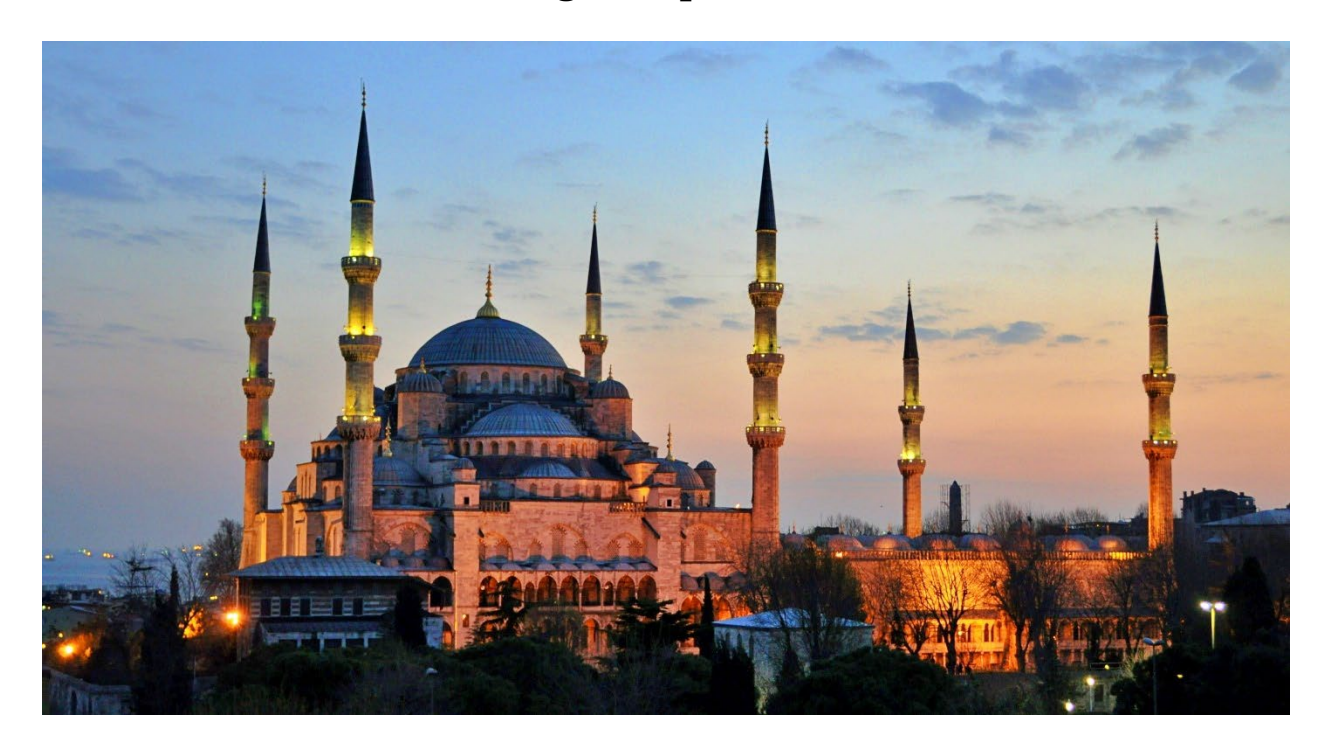
The majestic Blue Mosque against a clear blue sky

3. Istanbul, Turkey: Discover the rich history and culture of Istanbul as you photograph its iconic landmarks, bustling bazaars, and breathtaking mosques.