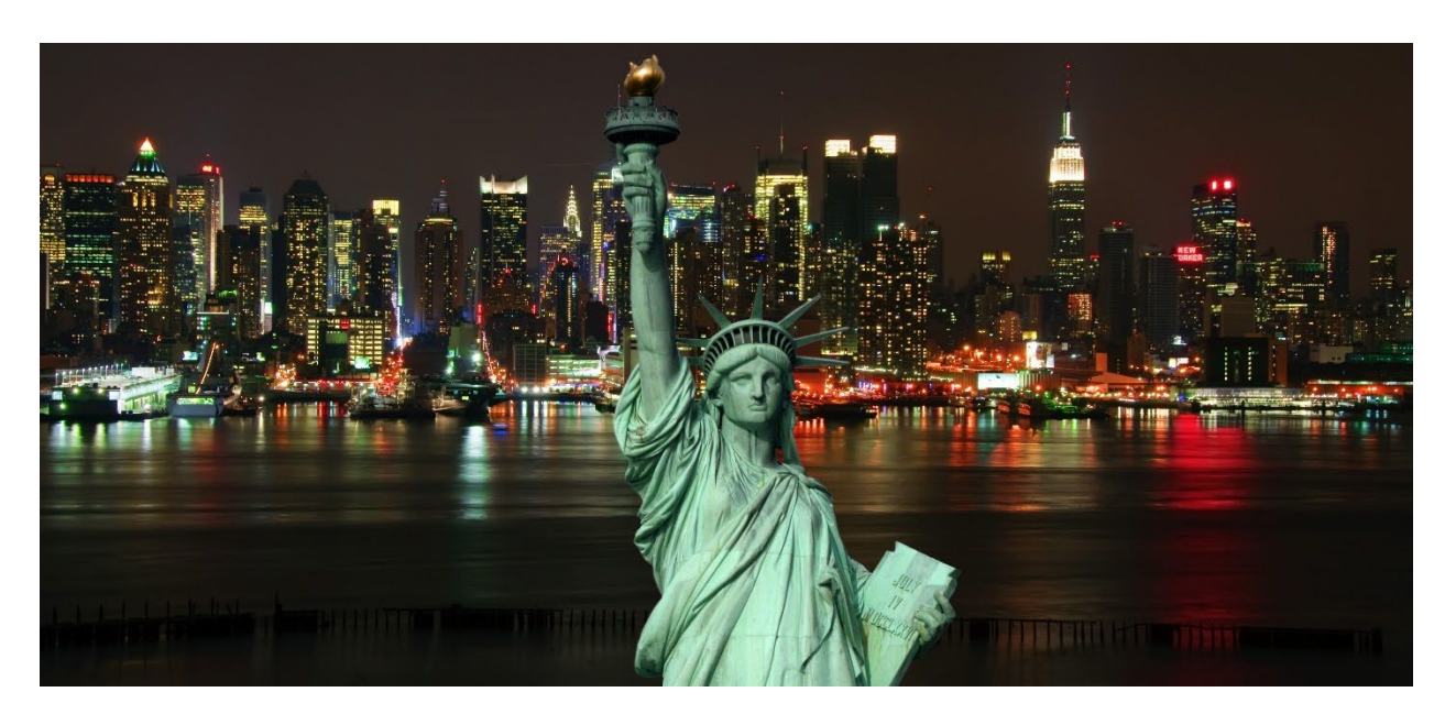
The Statue of Liberty framed by the night

3. Statue of Liberty, New York: Standing tall as a beacon of freedom, capturing Lady Liberty against the backdrop of the New York skyline is a must for any photographer.