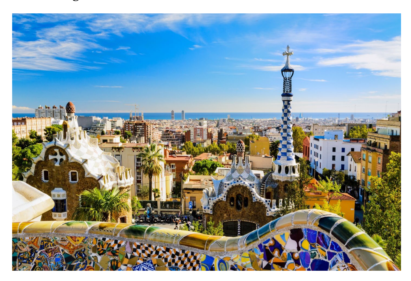
View of Park Güell with colorful mosaic tiles

2. Barcelona, Spain: Explore the vibrant streets of Barcelona and capture the colorful architecture, lively markets, and stunning views of the Mediterranean.